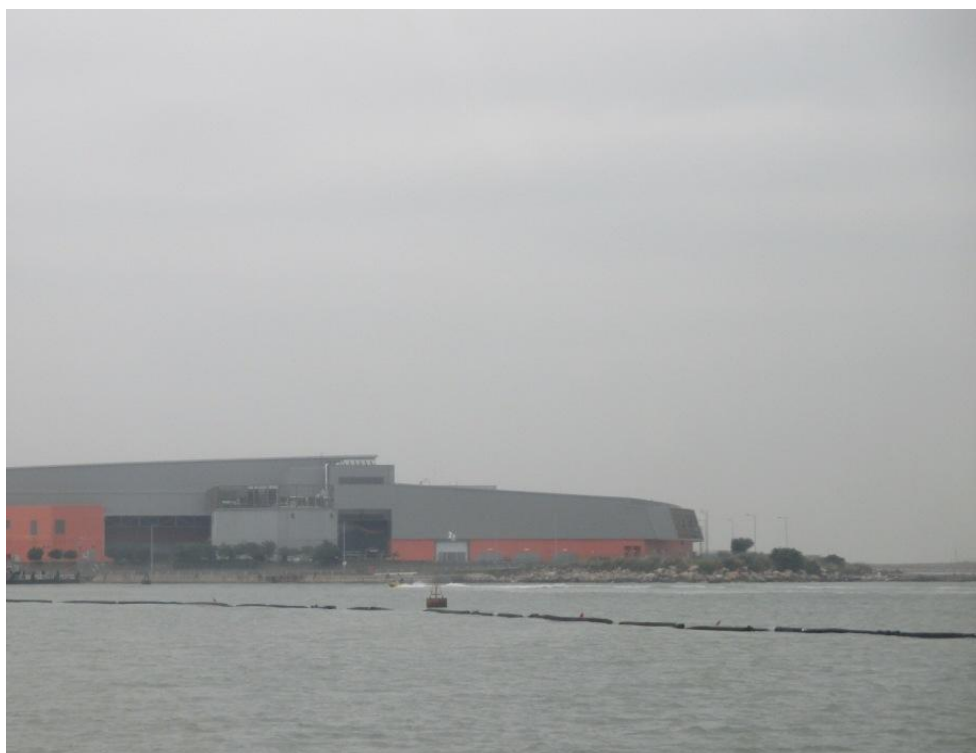
4.7.2.4 Exceedance recorded at IS10 and SR5 during mid-flood tide are unlikely due to marine based construction activities of the Project because: