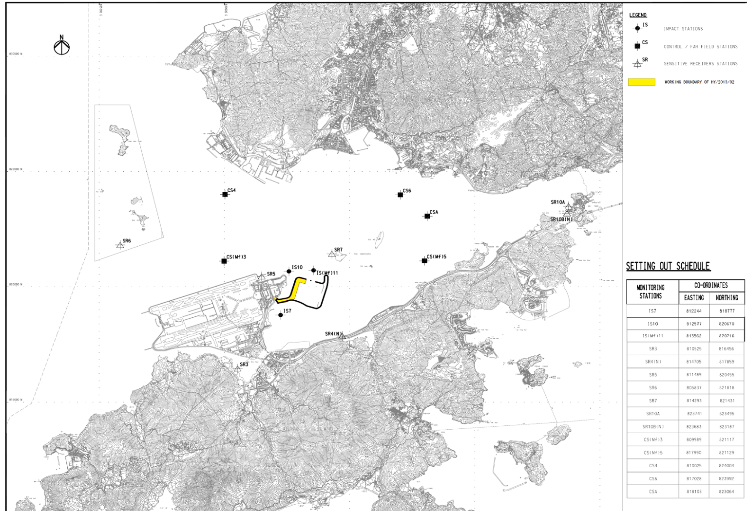
Figure 2 Water Quality Monitoring Stations(construction phases)