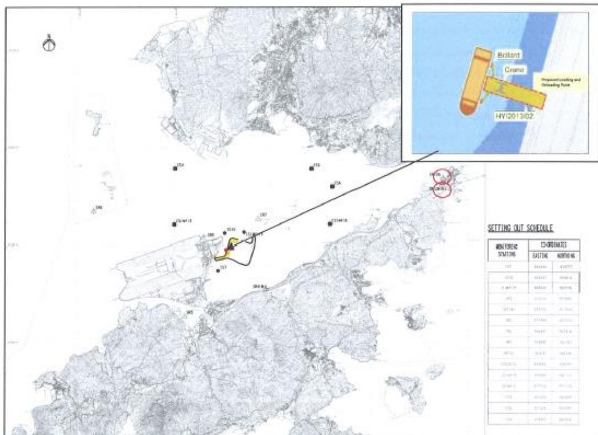
Figure 1 Location of Water Quality Monitoring Stations

*Monitoring was undertaken by the E.T. of Contract No. HY/2010/02