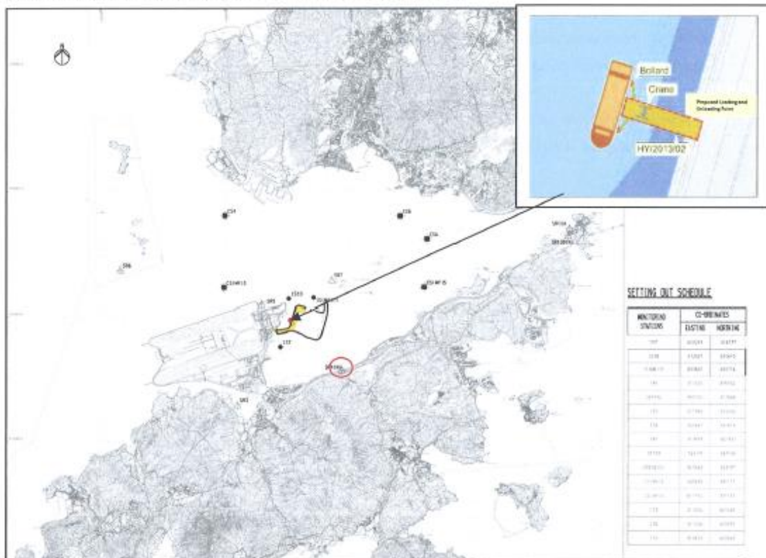
Figure 1 Location of Water Quality Monitoring Stations

*Monitoring was undertaken by the E.T. of Contract No. HY/2010/02