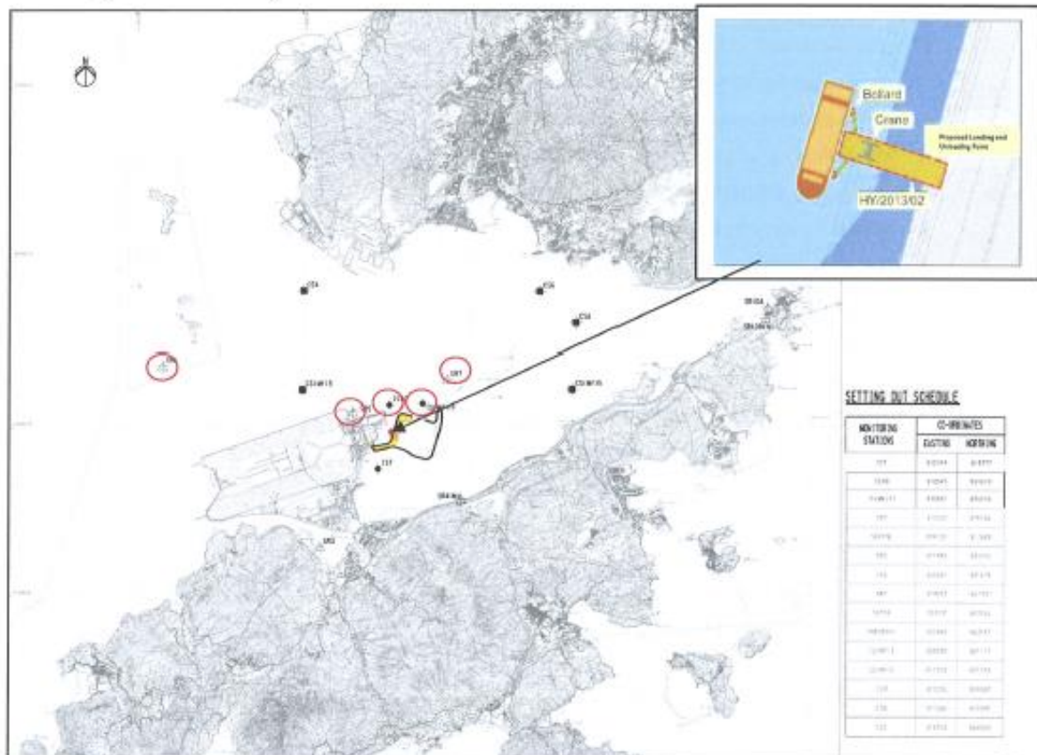
Figure 1 Location of Water Quality Monitoring Stations

*Monitoring was undertaken by the E.T. of Contract No. HY/2010/02