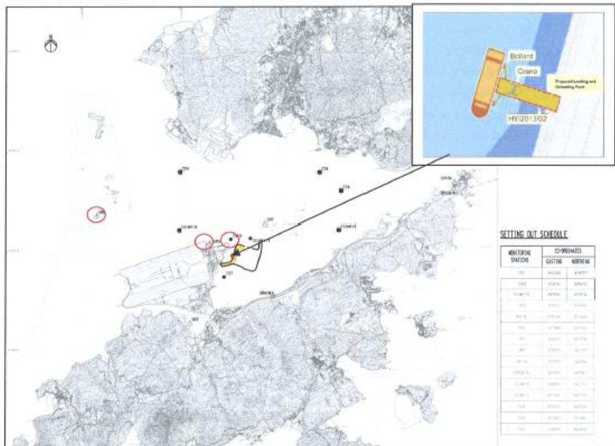
Figure 1 Location of Water Quality Monitoring Stations

*Monitoring was undertaken by the E.T. of Contract No. HY/2010/02