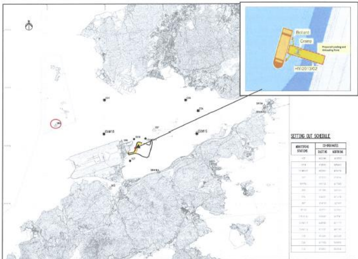
Figure 1 Location of Water Quality Monitoring Stations

*Monitoring was undertaken by the E.T. of Contract No. HY/2010/02