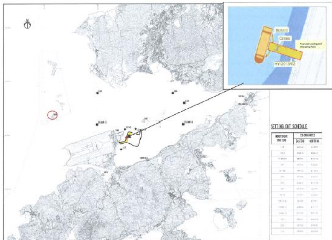
Figure 1 Location of Water Quality Monitoring Stations

*Monitoring was undertaken by the E.T. of Contract No. HY/2010/02