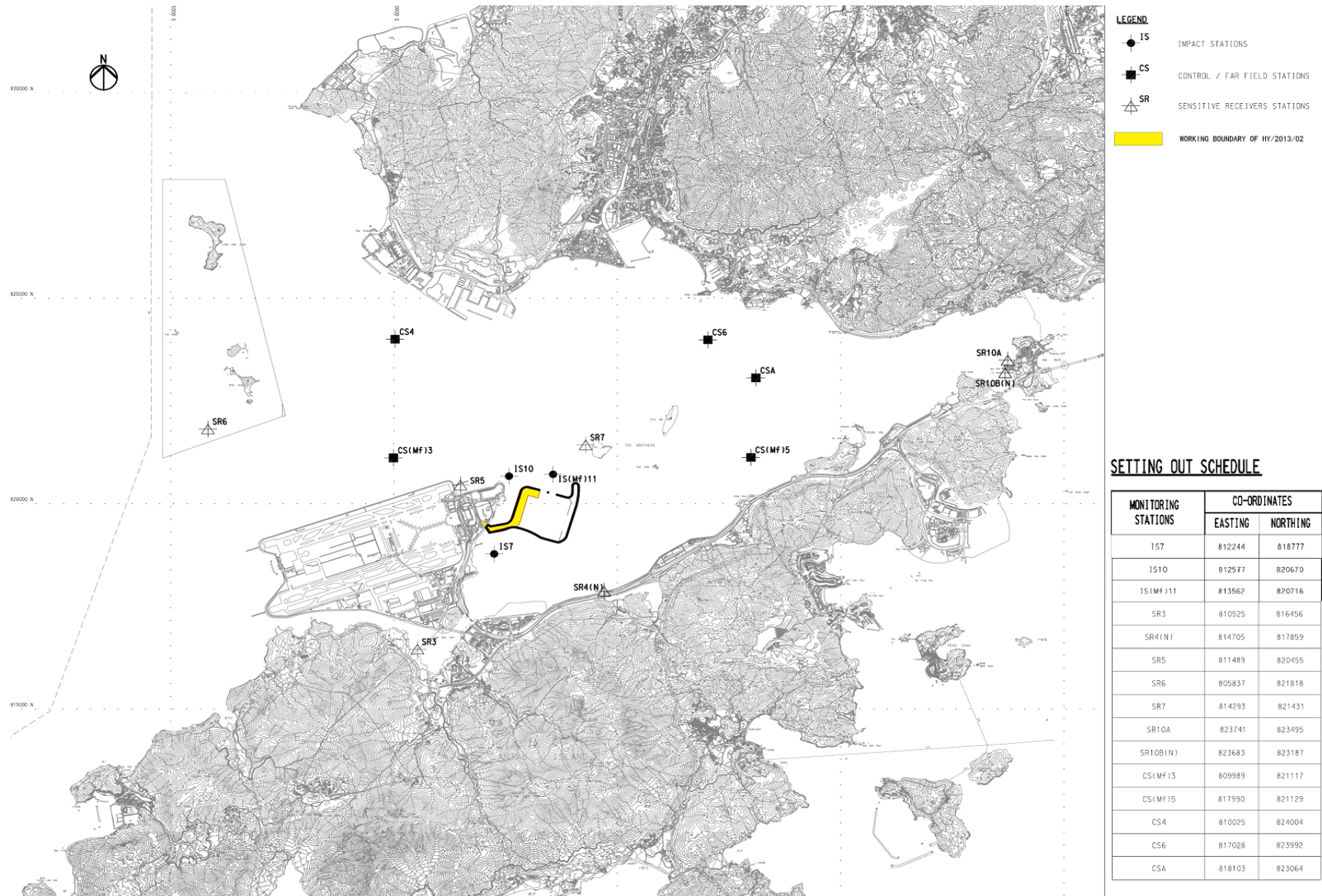
Figure 2 Water Quality Monitoring Stations (construction phases)