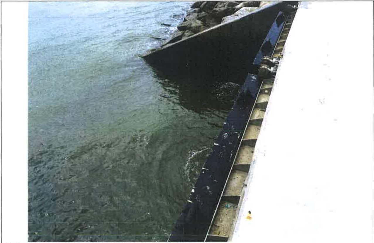
Photo 180627_001 -Box Culvert A on 27 June 2018