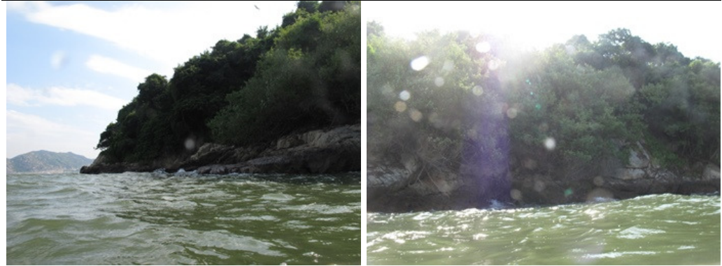
Substratum – Bedrock and Boulders