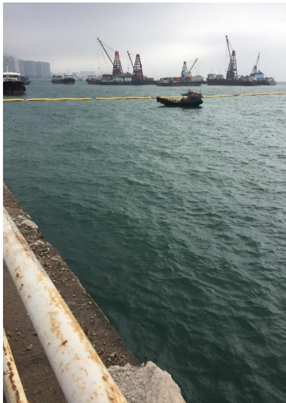
No improper discharge was observed on the seaside.