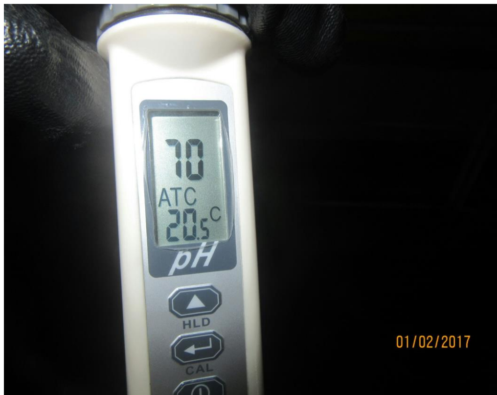
Water sample was taken for checking.