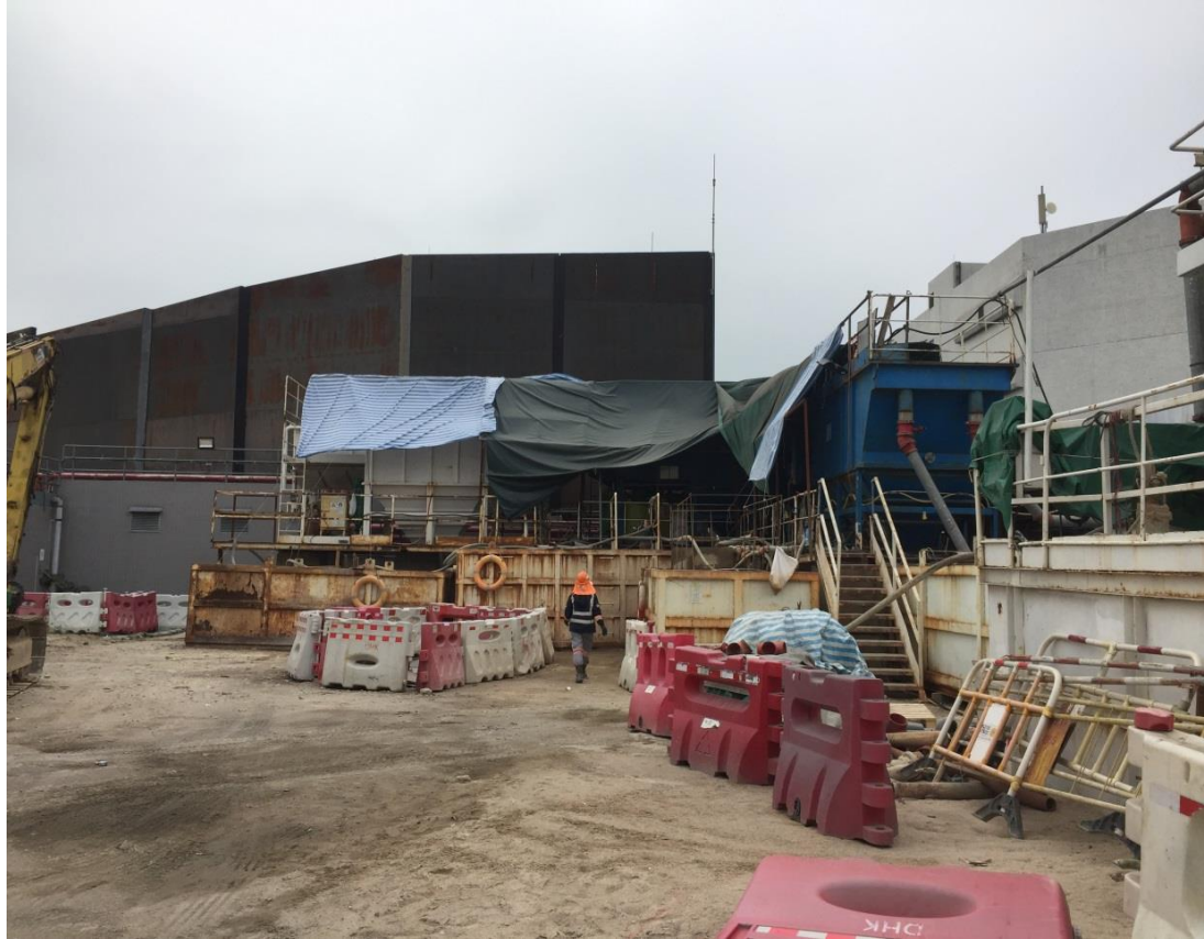
Wastewater was treated in the Wetsep before discharge.