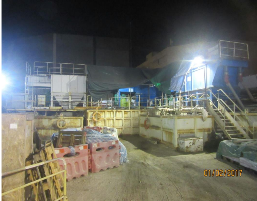
Wastewater was functioning properly.