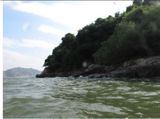
Receptor Site, Yam Tsai Wan