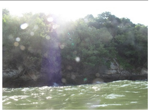
Substratum – Bedrock and Boulders