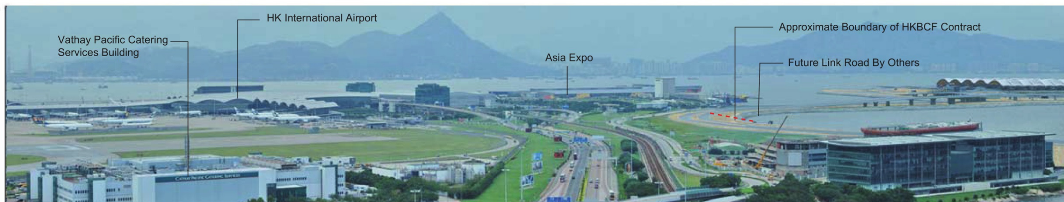
Development without Mitigation (Day 1 of Operational Phase)