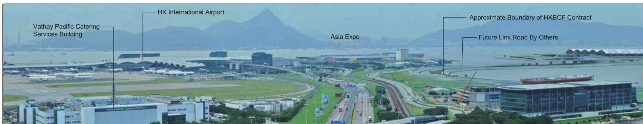
Development with Mitigation (Day 1 of Operational Phase)