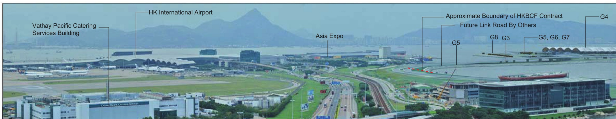
Development with Mitigation (Year 10 of Operational Phase)

Note: Reference to Landscape and Visual Impact Assessment (Ref. 072-02)